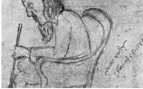
Lalan Fakir ( A mystic)