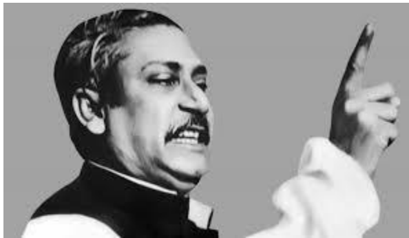
Bangabondhu Sheikh Mujibur Rahman, Father of the Nation of Bangladesh