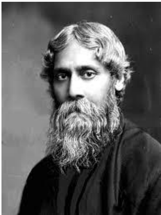
Tagore, Nobel Laureate for Literature