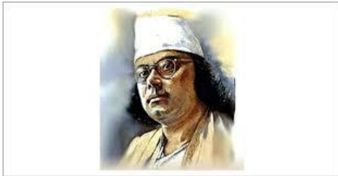
Kazi Nazrul Islam, the National Poet of Bangladesh