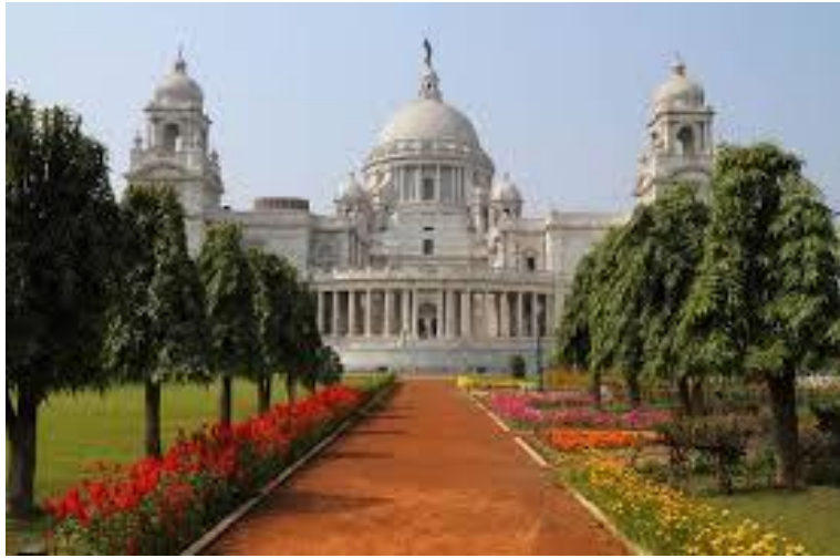
Victoria Memorial, Kolkata, India