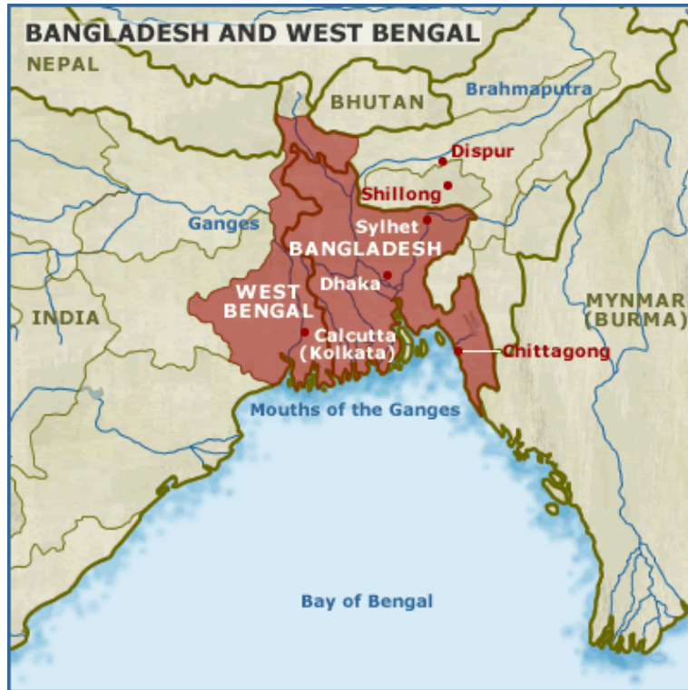
Bangladesh & West Bengal, i.e., Bengal (under British India.)

Bengali or Bangla, the 7th largest language of the world, is spoken by over 265 million speakers of the South East Asian nation of Bangladesh, its neighboring Eastern Indian states of West Bengal, Tripura, parts of Assam, the Andaman & Nicobar Islands, and the highly vibrant diasporas in New Delhi, London, Michigan, and New York City. Bengali belongs to the Indo-Aryan sub-group of the Indo-Iranian branch of the Indo-European family of languages. It is an SVO (Subject x Verb x Object 'I you love.') language, which is written from left to right, like English. Bengali developed as a distinct language around the 10 th century from the Middle Indo-Aryan dialect of Magadhi Prakrit, which had developed from a dialect or a group of dialects that were close, but not identical, to Vedic and Classical Sanskrit. The Bengali alphabet is derived from the ancient Indian Brahmi script, which was once closely related to the Devanagari script.