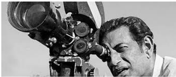
Satyajit Ray, Film Director