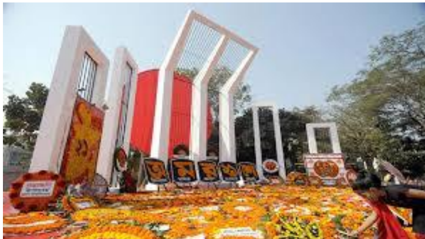
The Language Martyrs' Monument in Dhaka, Bangladesh